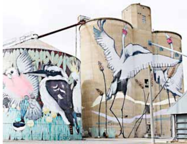
Wonderful Silo Art in Tungamah

BUT , our visit to The Spanner Man in Boort, was amazing. He has created beautiful specimens using old rusty spanners!!