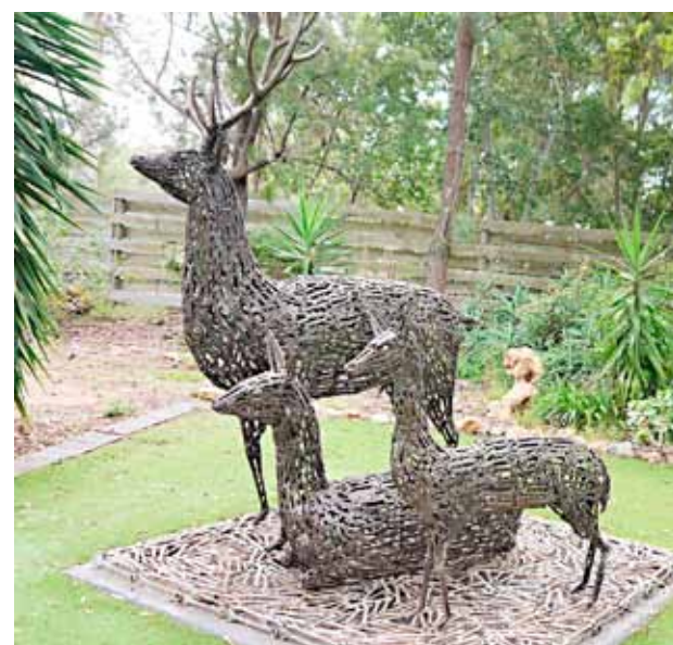
Deer at the Spanner Man in Boort

A Tour of the Old Treasury Building, to discover stories of Robert Hoddle's grid plan for Melbourne, Ned Kelly's only surviving letter, Burke and Wills maps, and the Eureka