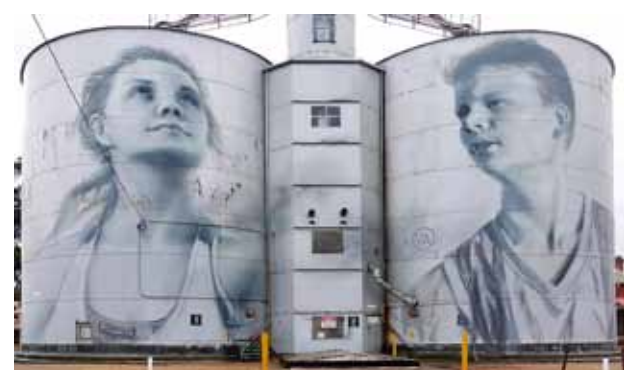
Silo at Rupanyup